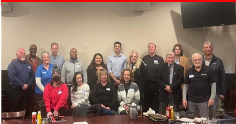
Kiwanis Club of North Aurora

The Eye of the Tiger Kiwanis Club is offering Key Club Heart for Service Award to one Key Club member who has a heart for service to attend the 2023 Annual Key Club Convention in Anaheim, California, USA. This award of $1,000 (US) is awarded to one top-qualified Key Club applicant from a high school in any district represented by a member of the Eye of the Tiger Kiwanis Club. This award is for reimbursement of registration, travel, and accommodations up to $1,000. All rules for Key Club travel must be followed.