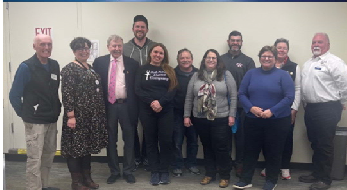
Kiwanis Club of Genoa Kingston